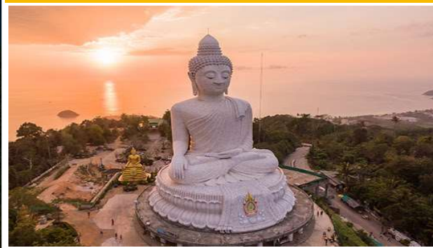
Wat Phra Yai